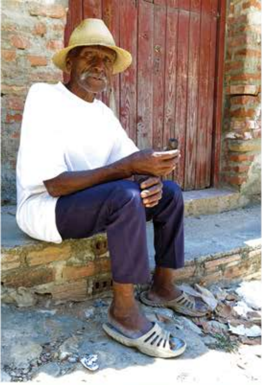
PICS: clockwise from top left - Trinidad doors and windows Old man with his pipe Local lady watching over the street Tethered horse Caged songbird Watching the world go by