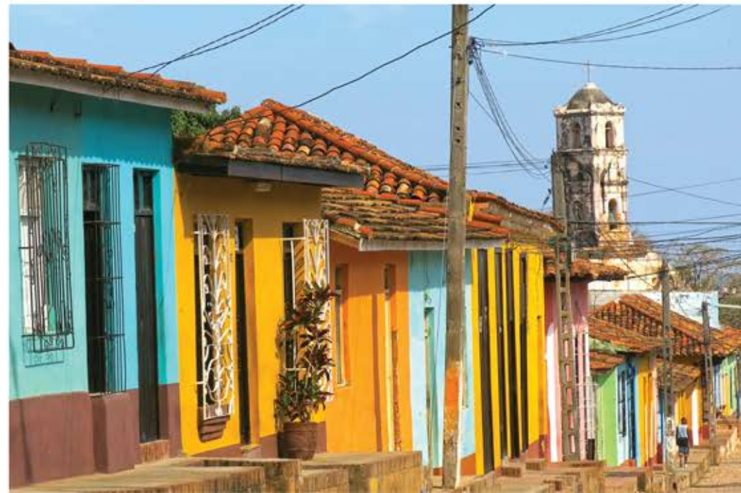
PICS: clockwise from main pic opposite - Piccola Chiesa or small church Limes for Cuban Mojito or Canchanchara Traditional doorway Typical Trinidad street with brightly painted casas